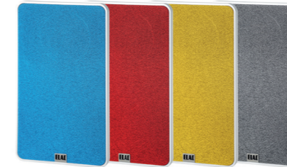
Cover grille fabric in different colors