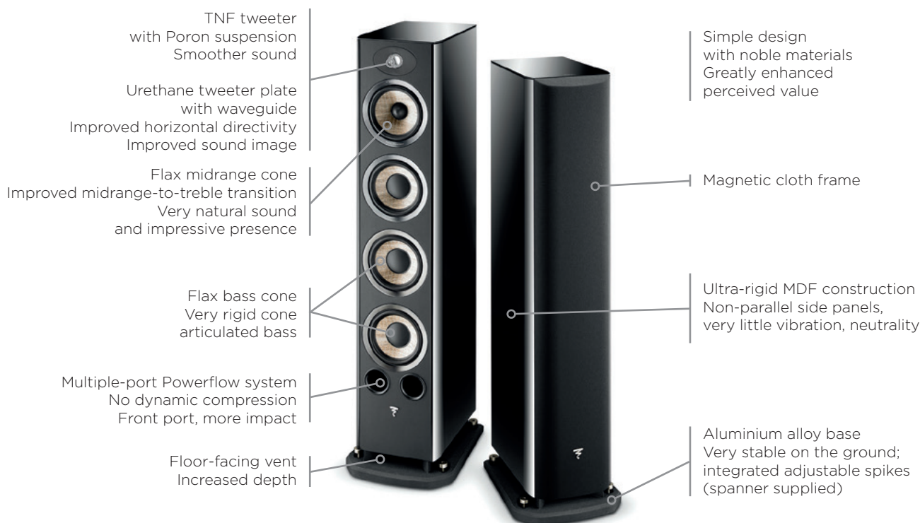
Aria 936 Black High Gloss

The Aria 936 is a 3-way loudspeaker featuring an elegant design and a small footprint. Very linear and with impressive dynamics, thanks to these 3 woofers, it is naturally intended for listening in stereo for monitoring-type activities. This loudspeaker is also ideal for setting up a spectacular Home Cinema system. Appropriate for rooms measuring from 270ft 2 (25m 2 ) and from a listening distance of 10-12ft (3m - 3.5m).