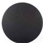
black grill (option)