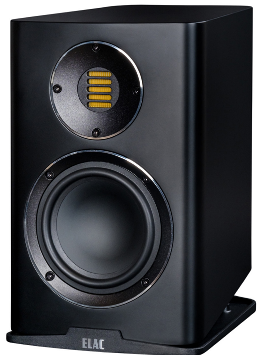
Front Carina BS 243.4