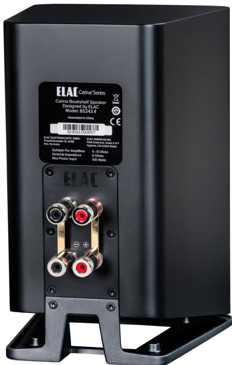
Back Carina BS 243.4