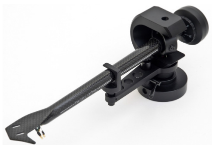
carbon fibre tonearm: Non-resonant tube with low friction bearings